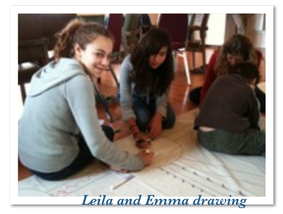
on the Tree of Life schematic 11-13-11

Reception and Luncheon will follow the service.